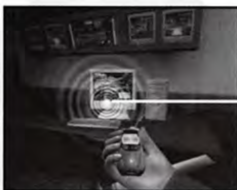
Download programs from the green beacon

If the device is receiving red pulses, you must first locate the program emitter and download its program before you can activate it with your Q-Remote.